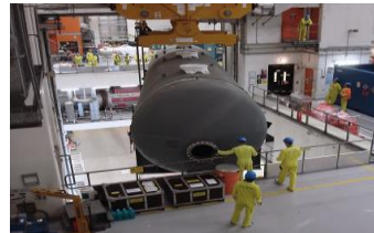
Forsmark, Sweden: Turnkey heat exchanger and MSR upgrade within shortest period of time