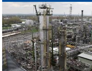
Oil & Gas